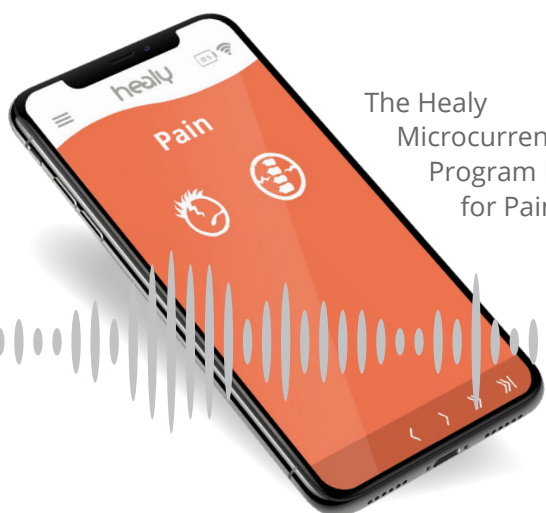
The Healy Microcurrent Program Page for Pain

Even the slightest pain, if you have to endure it long enough, can make everyday life unbearable. Healy uses microcurrents on different areas of your body to relieve and manage pain. It even relieves muscle strains and soreness from exercise or work around the house. All the Healy Editions contain its pain relieving microcurrent applications.